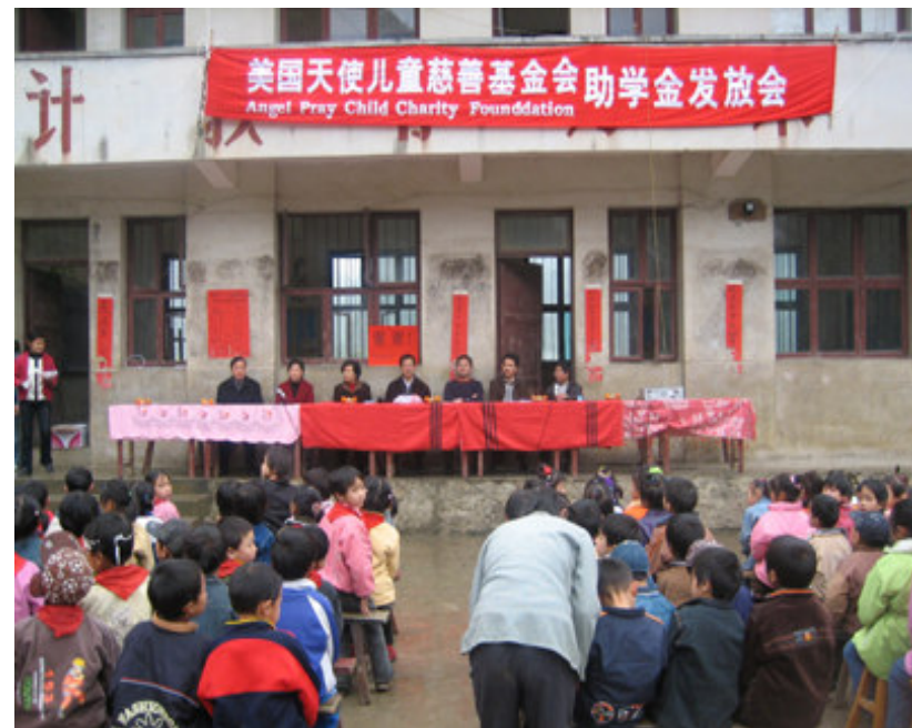
五和小学助学金发放会 Conference meeting in Wu He Elementary School

Many of these students live in the villages among the mountains. Some of them are orphans, some of them have single parent. Their living expense is only RMB 30-50 ($4 to $7) a month. And the money is borrowed from the relatives. Their parents took the burden of the tuition, work harder and harder. Many of students are smart and have a good grade in their previous study. But they worry about the food each day. We wish we can give more support in the future.