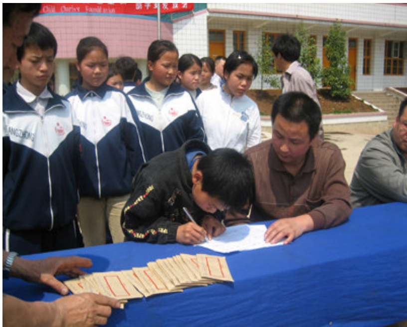
唐力初中贫困住校生正在等待签字收领助学金 Students from Tangli Middle School are signing the receipt