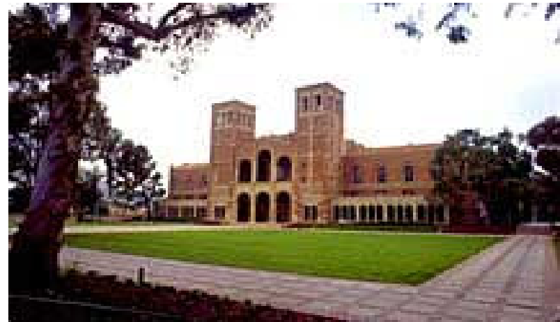
(UCLA: Royce Hall from across the quad)